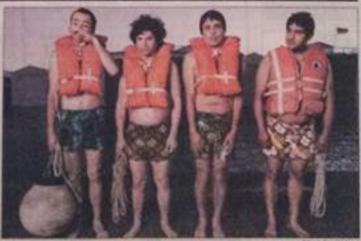
THEY MIGHT CHANGE YOUR LIFE: Indie pop band the Shins' new album Wincing the Night Away lacks natural ease but is not without charm.

EXTRA: Listen to clips of songs from Wincing the Night Away by The Shins. chron.com/music